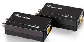
G.hn Ethernet over Coax Adapter GCA-6000

Quantity: ~2 per Residence Utilized in over 500 Homes